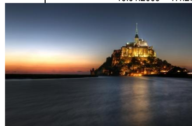
06 | Mont Saint Michel (FR) 29.07.2010 – 22h58