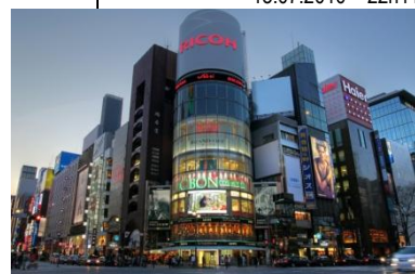
12 | Ginza (JP) 04.01.2010 – 17h41