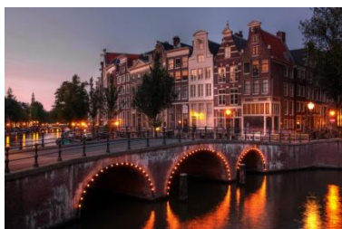
02 | Amsterdam (NL) 18.09.2009 – 20h12