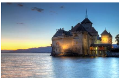
01 | Chateau de Chillon (CH) 25.07.2009 – 21h27