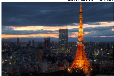
04 | Tokyo (JP) 03.01.2010 – 17h59