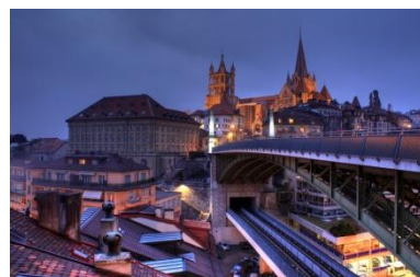
03 | Lausanne (CH) 10.01.2009 – 17h27