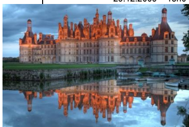
11 | Château de Chambord (FR) 27.07.2010 – 21h31