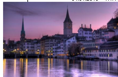
15 | Zurich (CH) 27.02.2009 – 18h26

Printed on canvas and mounted on 90x60cm frames. Unlimited edition. Price: 150CHF .