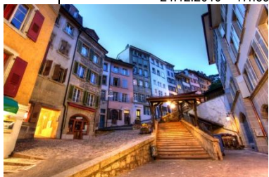
13 | Lausanne (CH) 28.04.2010 – 21h06