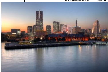
08 | Yokohama (JP) 29.12.2009 – 18h04