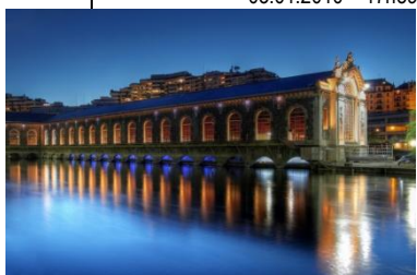
07 | Geneva (CH) 11.06.2010 – 22h14