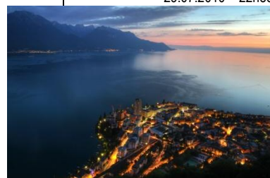
09 | Montreux (CH) 15.07.2010 – 22h11