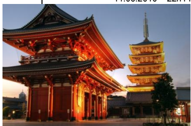
10 | Asakusa (JP) 24.12.2010 – 17h59