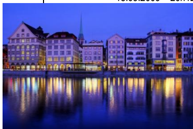
05 | Zurich (CH) 27.02.2010 – 18h31